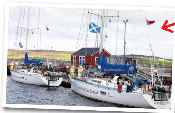
The Big Commute stopping off in Lerwick