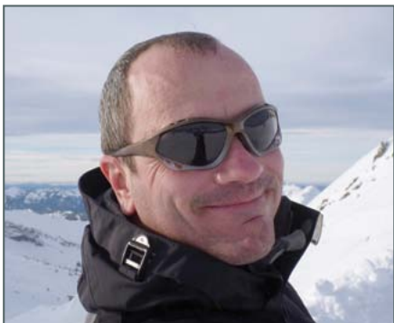
Message from the Chief Executive

Thanks to the tremendous support of our funders, the amazing commitment and dedication of our volunteers, and the hard work and professionalism of our staff, 2014 proved to be a highly successful year for OYT Scotland.