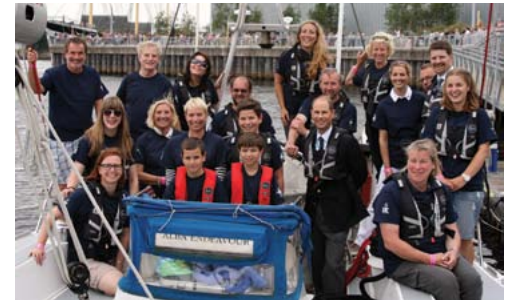
Commonwealth Flotilla Crew with HRH Earl of Wessex