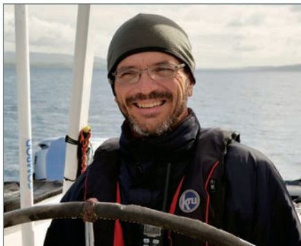
Message from the Chief Executive

Thanks to the amazing contribution of all our wonderful volunteers, the dedication and professionalism of our hard working staff and the tremendous support of our Patrons and funders. 2015 proved to be a highly productive year for OYT Scotland.