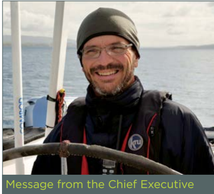
Message from the Chief Executive

In the last year, OYT Scotland has continued a journey that started almost 20 years ago, delivering life-changing adventure under sail to young people. Over the years, our work has been made possible thanks to the hard work and dedication of all of our wonderful volunteers and small staff team, as well as the fantastic support of our Patrons and funders. We simply could not do it without you.